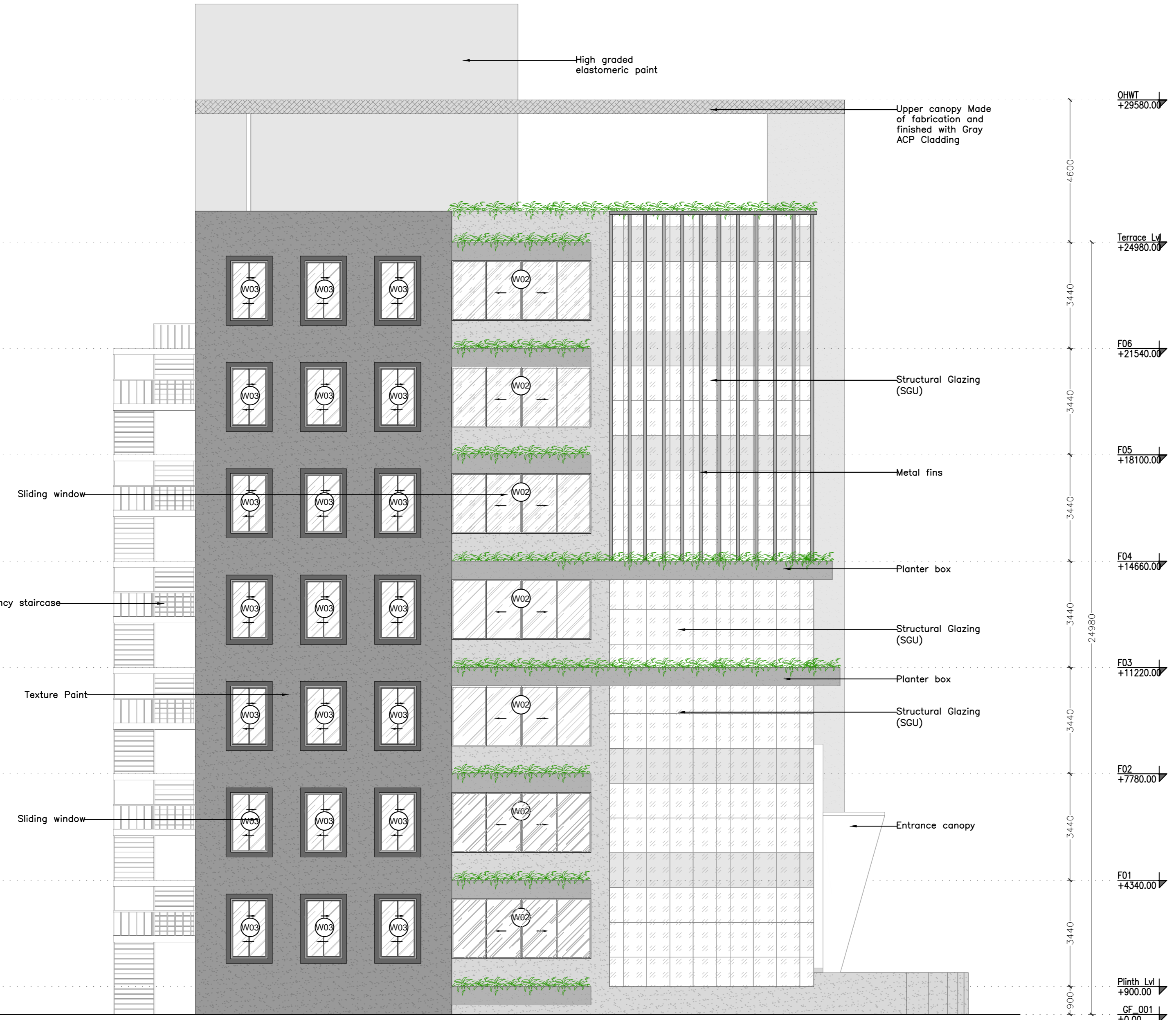
Elevation B (East Side) Scale 1:100

LAST SAVED BY: jengriner 10/10/24 11:53 AM This drawing is property of Mamta Shah & Associates. Without our prior consent, it must be neither copied nor made available to third parties, nor must it be used by the recipient or third parties for the purpose other than for which it is meant.